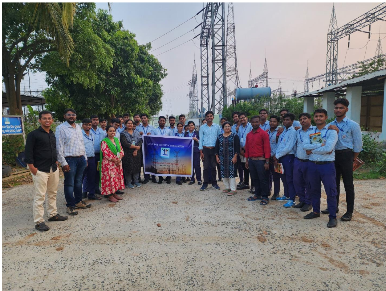
Study visit 2024-2025