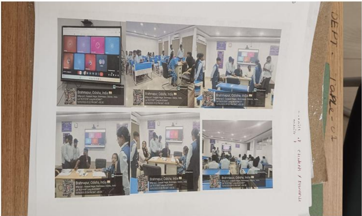
PTM 5 th SEM